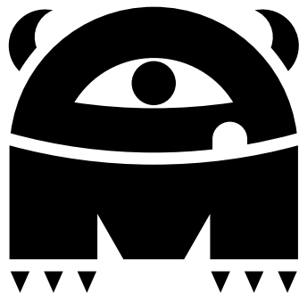
SoftChaos: Webtractor, WorkStrip Delicious Monster: Delicious Library

We are very pleased to welcome to newest additions to our vendor partners, SoftChaos and Delicious Monster . Both of these outstanding companies offer excellent support for user groups and continue to produce excellent products that are worth showing to your group members.